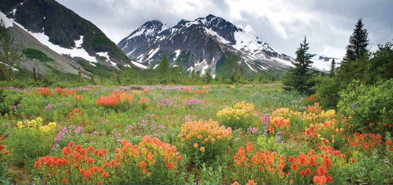
WILDFLOWERS IN ATLIN-TAKU, BC

The Canadian Parks and Wilderness Society (CPAWS) is Canada's pre-eminent, national community-based voice for public wilderness protection.