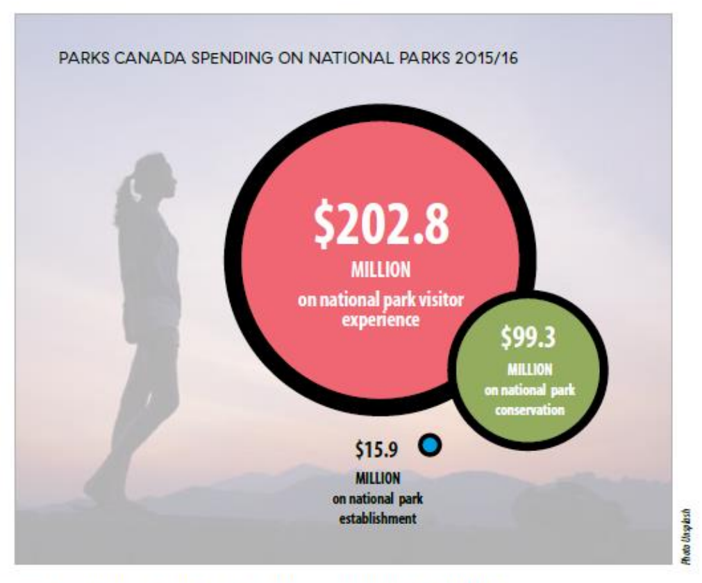
Data from Parks Canada Report on Plans and Priorities, 2015/16 25

In 2015/16, spending on national parks conservation made up only 13% of Parks Canada's overall budget, while approximately double this amount was spent on the visitor experience program.