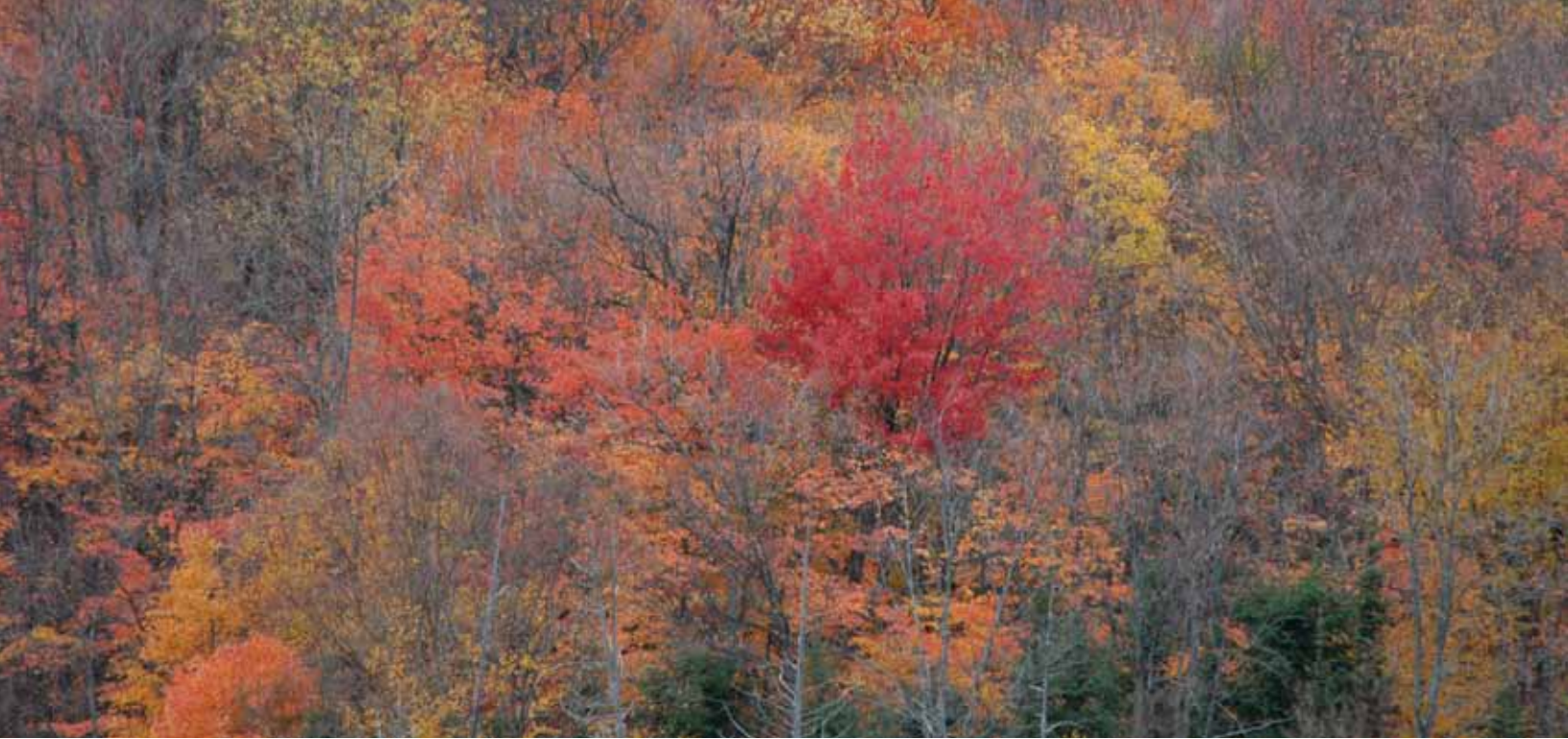
FALL COLOURS IN ONTARIO'S ALGONQUIN PARK