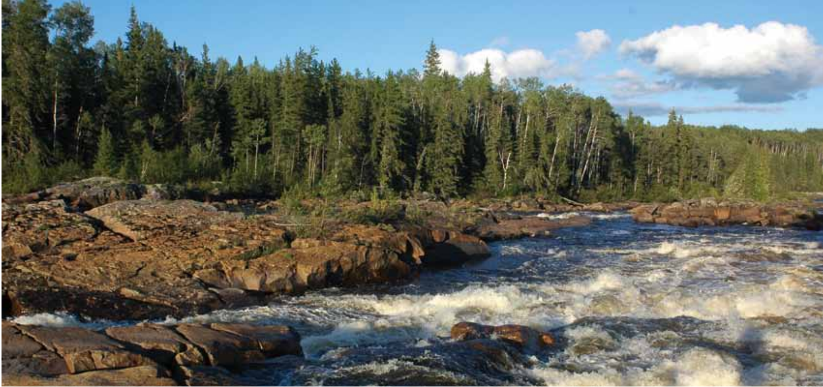
ABOVE: BOREAL LANDSCAPE.