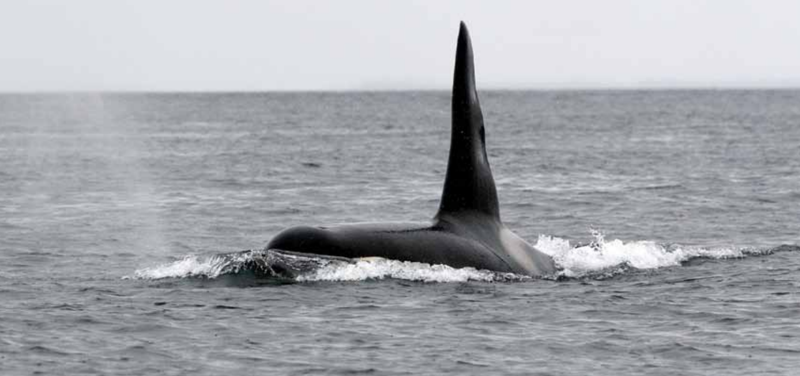
ORCA OFF THE COAST OF BC