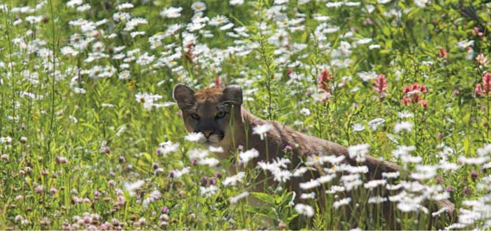
COUGAR, FLATHEAD VALLEY, BC