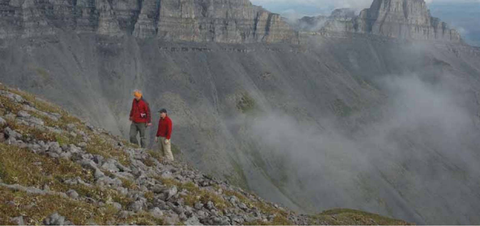
HIKERS IN NAHANNI NATIONAL PARK RESERVE.